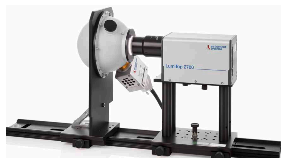
▲ Measurement setup for both 2D and CAS audit.

The image sensor calibration of luminance and color measurement cameras (2D audit) and the measurement accuracy of photometric measuring devices (CAS audit, ACS 150 only) are tested in the same measurement setup: at a distance of 2 mm from the camera objective lens housing.