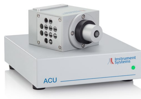
▲ ACU 100 control unit

Moreover, the relevant program libraries (.dll and .dylib) are available for direct access for both operating systems Windows and OS X.