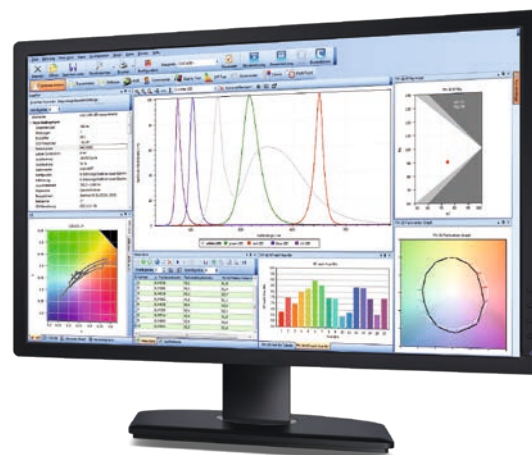
SpecWin Pro spectral analysis software.

or transmissive properties. With the Goniometer module a goniometer system, e.g. LEDGON can be controlled. The Commander module is a programming interface where measurement sequences can be created by just a few clicks.