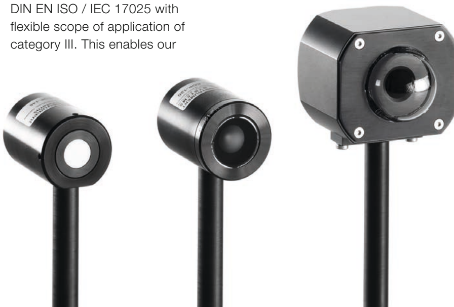
EOP optical probes with different light throughput and angular response characteristic.

All standards used are directly traceable to the reference standard of the national laboratories PTB (Germany) or NIST (USA). The test certificates included with our measuring instruments depict details of the traceability chain.