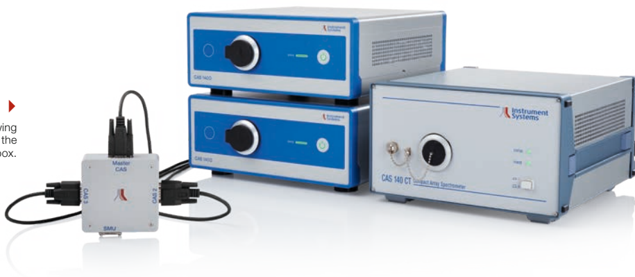
Example MultiCAS measurement setup showing two CAS 140D, one CAS 140CT and the MultiCAS hardware trigger box.

The additional MultiCAS hardware trigger box ensures that the spectrometers are activated synchronously. The software application SpecWin Pro automatically combines the individual spectra into a total spectrum. An additional step within the factory calibration of the complete setup guarantees precise measurement results.